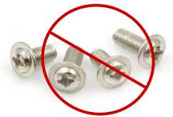
No Screw Needed