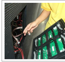
Full Front Service

The revolutionary design makes it an ideal solution for the outdoor school message centers