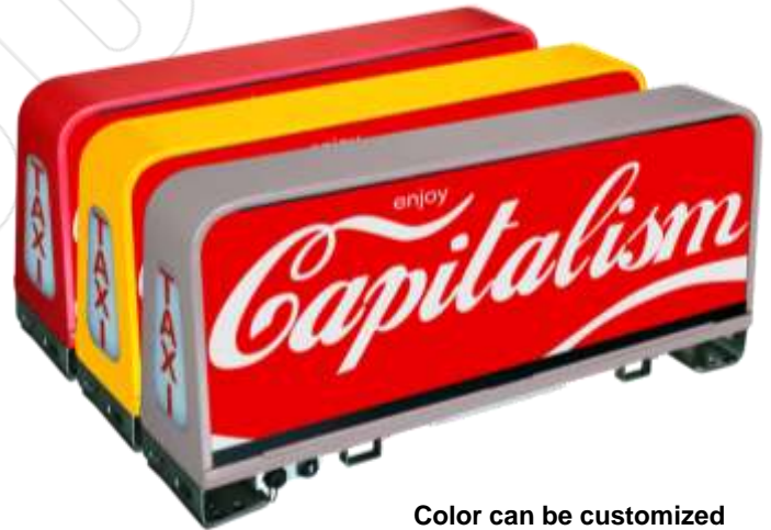
Color can be customized

With 3G, wifi or group control of the signs, GPS locking the place to place for certain advertising.