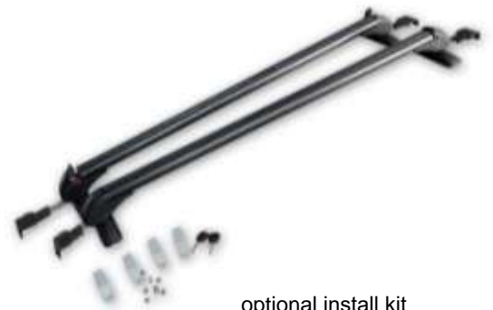
optional install kit